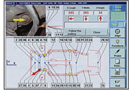
Touch versatility allows you to measure & document hundreds of under and upper body points and shows you which way to pull.