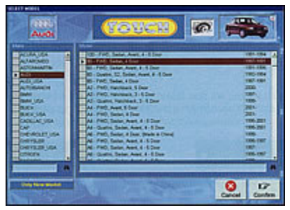
Touch has over 4000 vehicles in its database to give you complete measuring capabilities.